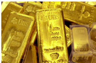
Don't fixate on gold in your portfolio