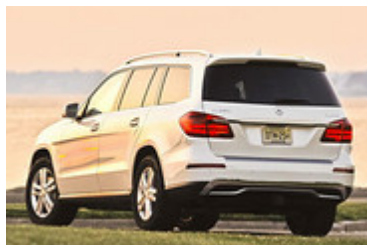
2013 Mercedes-Benz GL350 Bluetec