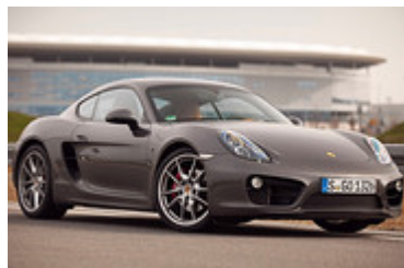
Porsche Cayman S: 911's little brother grows up