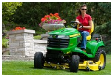
The Rolls-Royce of riding mowers